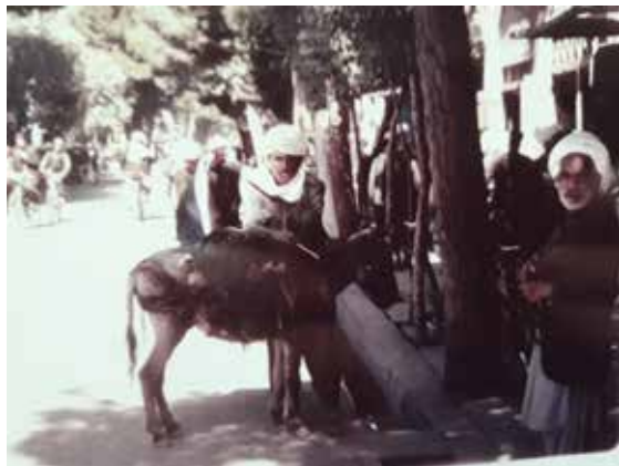
Herat street scene

Part of the adventure was to do it all as cheaply as possible. An old diary I found shows what we paid for transport from Istanbul to when we entered India: about $25 each in 1974 prices. A mud floor and wall 'hotel' in Herat in western Afghanistan cost 15 Afghani a night, with rats, a horsehair and straw paillasse mattress, and complimentary hashish or opium, usually smoked with the hotel owners who liked to play the travellers at chess. There were 40 Afghani to the US dollar. The decrepit buses we travelled in regularly broke down, till the driver's clanking under the bonnet for an hour got them going again.