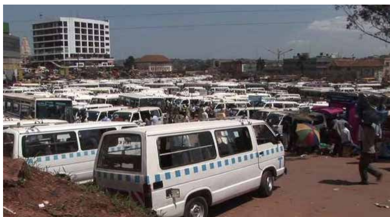
Kampala bus station

Ugandans are generally large, often tall and immensely open people with a quick disposition to laughter. When they shake your hand, they do it gently but hang on for quite a while till it becomes almost an act of holding hands. I never met one in that week with any agenda to try and milk me of money on some pretext, as is an almost daily experience in poor nations everywhere.