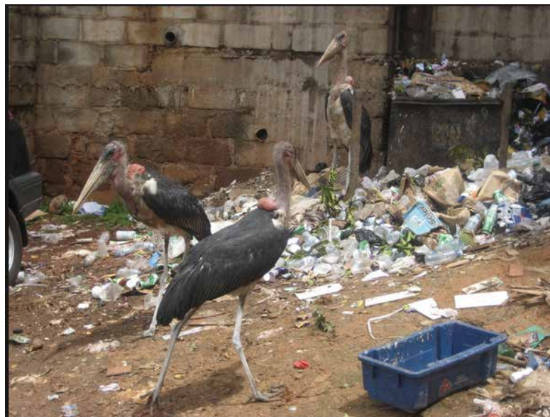
Marabou storks, Kampala

At the end of the first day all the consultants were driven into Kampala to wander around and take in the sights. Huge, decrepit marabou storks mingled with people on footpaths, and watched everything from branches and fences, their stooped, bald heads, filthy black and white feathers and blood stained, scabrous faces making them look like ancient guards from some Hades. They surveyed the scene for edible garbage and carrion such as dead town dogs. I wondered how many of them had feasted on human corpses during the Amin and Obote eras of mass killing.