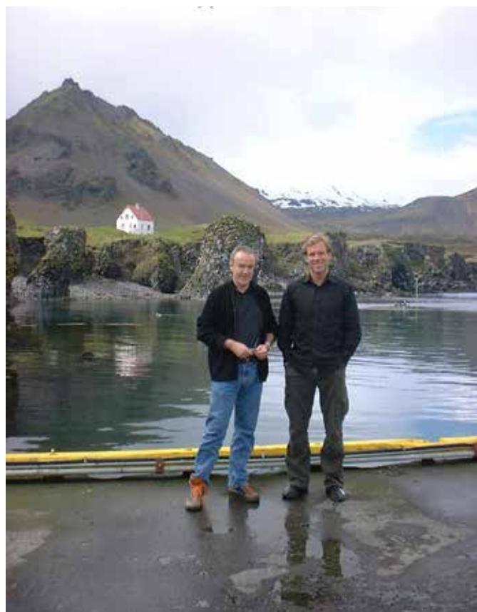
Wodin and Thor