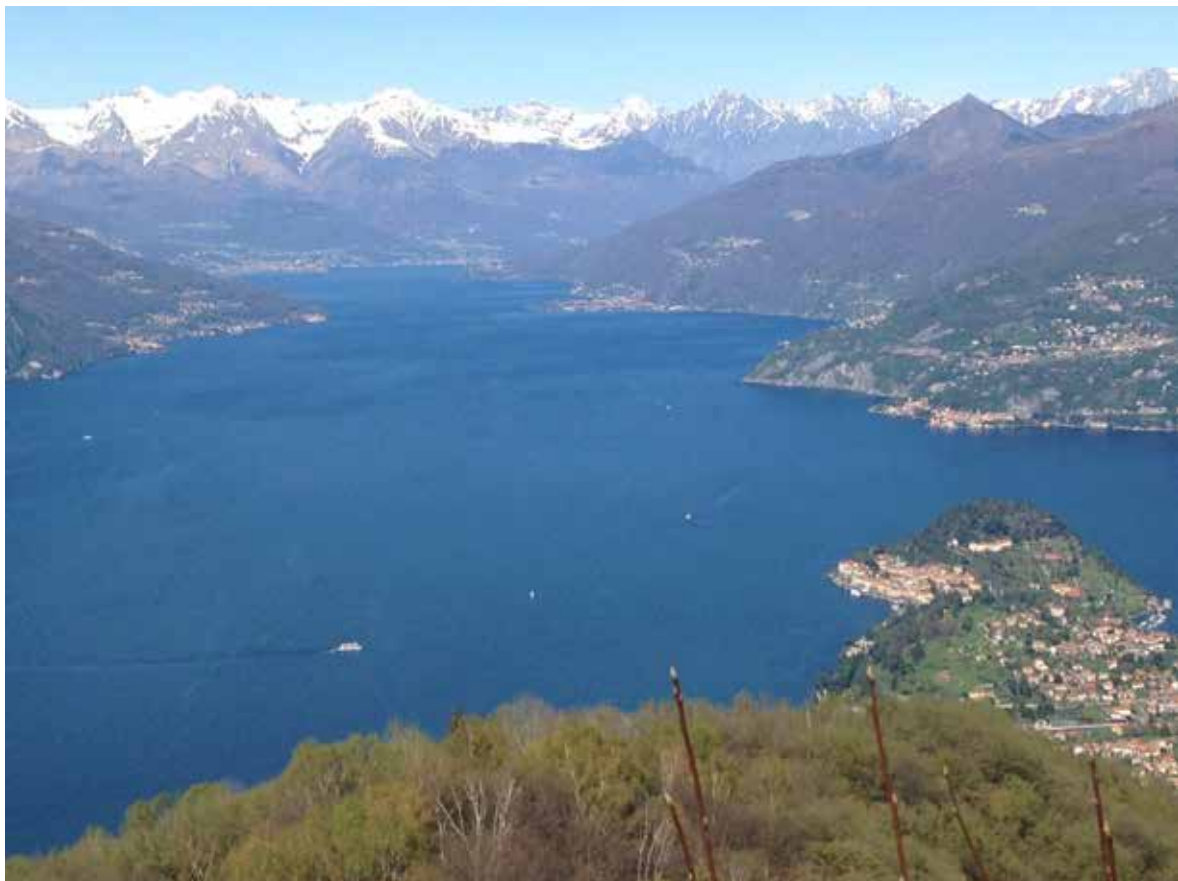
The view from the top of the estate

It was early April in 2014, and along with 11 others – several who’d brought partners – I had been selected to spend a month in residency at Villa Serbelloni in Bellagio on a small promontory where Lakes Como and Lecco meet in Lombardy in northern Italy. The huge two-story villa originally dating from the 15 th century (although much changed since) with panoramic views over the two lakes was bequeathed to the Rockefeller Foundation in 1959 by the American Principessa deal Torre e Tasso to establish a centre “for purposes connected with the promotion of international understanding”.