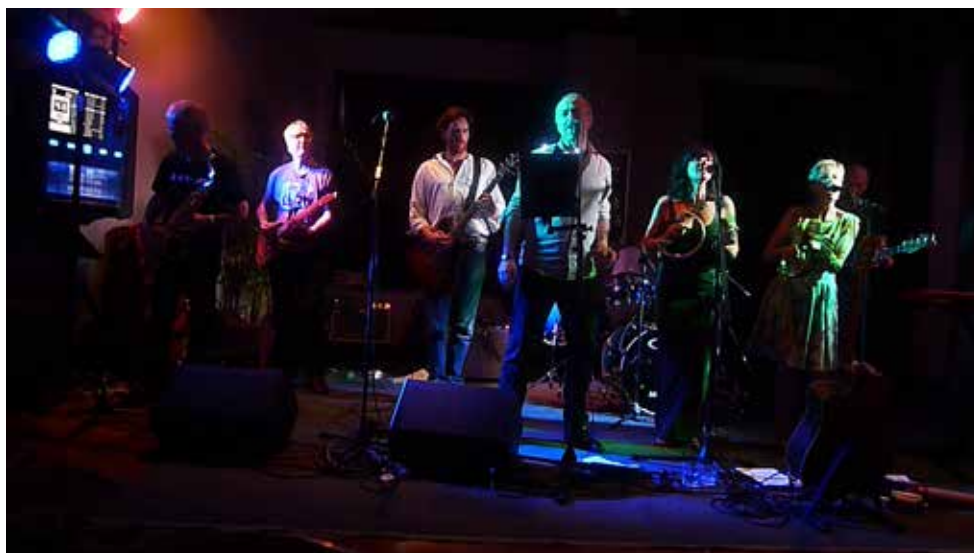
Exchange Hotel, Annandale