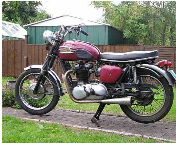
Triumph Thunderbird 1960s

The next day I told the story to a constable at Glebe police station. "You'll have to have more for us to go on that what you've just told me, mate" he said. So I knew the name of the guy who'd taken it, where he drank and the cops were still not a bit interested.