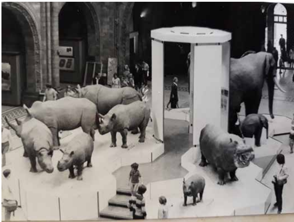
The Natural History Museum main hall in 1973

On the first day there, I walked into Australia House at the Strand. I went into the library, dropped the name of a librarian friend at my university in Sydney who I said had recommended that I try Australia House. I asked if they had any jobs or knew of any in other libraries. I'd had a bit of casual work stacking returned books, so was plainly a skilled worker.