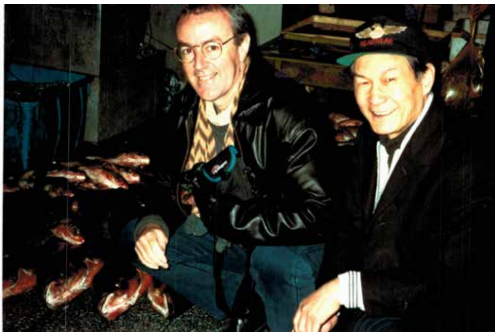
Weihai fish market

At dinner on the third night, a meat dish had me stumped. It was a dark meat but had a texture I couldn't pick. I asked the translator to ask the table if they knew what it was. After some time the verdict came back. "It is a strange animal from the mountains but we do not know its name". Some sort of goat? Deer? Pangolin? The conversation turned to what we eat in Australia and I emphasised seafood. Many of the students were from inland cities and so had limited experience of fish.