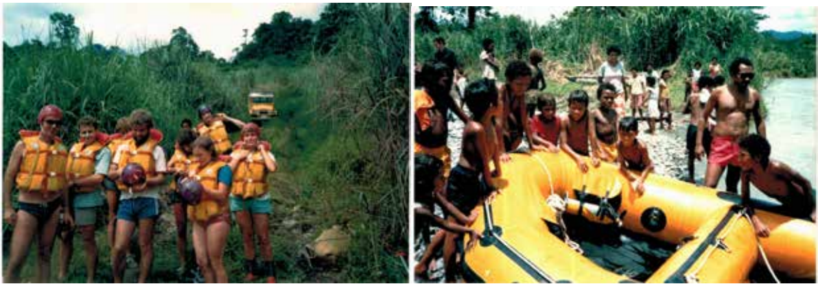
Rafting the Angabanga

We slept the first night in light sleeping bags on a small sandy beach with towering cliffs on either side of us. Fireflies hovered around us and at first light I saw a magnificent large hornbill in a tree near us. Later in the trip we saw small freshwater crocodiles, after earlier being assured there were none in the area we had slept.