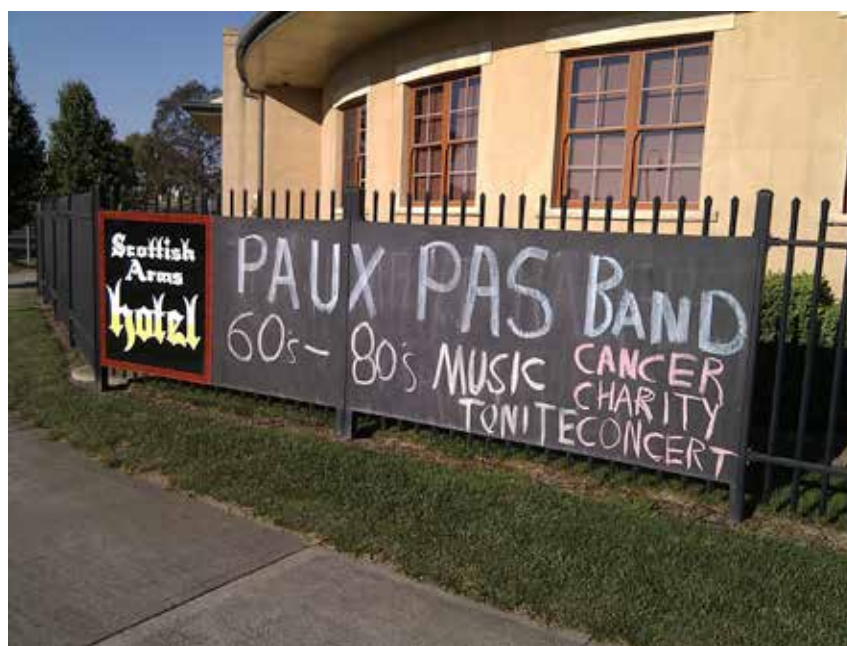
Faux Pas? Paux Pas? Fox pus? Oxford/Cambridge, tomayto/tomarto?

We sound-checked at 6pm to an all but empty pub and then ordered pub food. At 6.30 the publican nervously asked when we planned to start playing. We told him about 8pm. "There won't be anyone here by then" he told us. "They all go home by about 7.30 to watch telly." At this point there were about 15 people in addition to us in the room. All but two were wives and friends. The other two were an aged couple, the man in a wheelchair. They'd heard me spruiking it on the radio that morning and had driven down from Campbelltown. They left half way through our first set. So we played to ourselves, our dutiful entourage and a local gasbag who arrived late and told us he was very good mates with the shock jock Alan Jones who had a place down there. "I can get Alan to promote you guys next time you come down" he promised. The pub even messed up our name.